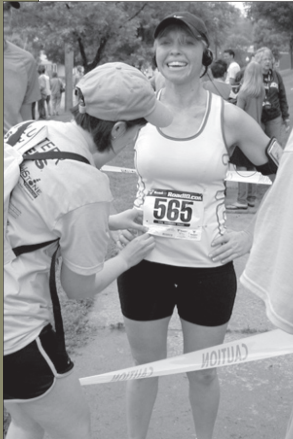
Racer No. 565 was an early finisher in the Dollars for Scholars "Dam to Downtown" race that benefits area high school seniors. Dollars for Scholars is a partner in philanthropy with the Community Foundation of Johnson County.

Thunder exploded along Prairie Du Chien Road in June. Storms weren't in the area—the noise was generated by hundreds of runners participating in a 10K footrace. Racers and their supporters pledged to raise more than $15,000 for local high school students seeking a college education.